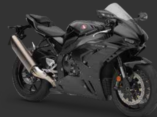
MATTE PEARL MORION BLACK (STANDARD)