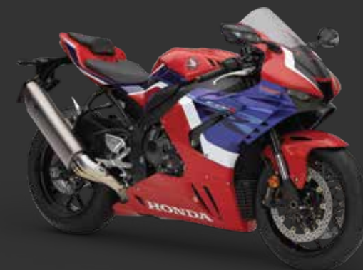
GRAND PRIX RED (STANDARD)