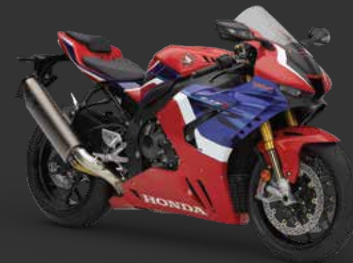
GRAND PRIX RED (SP)